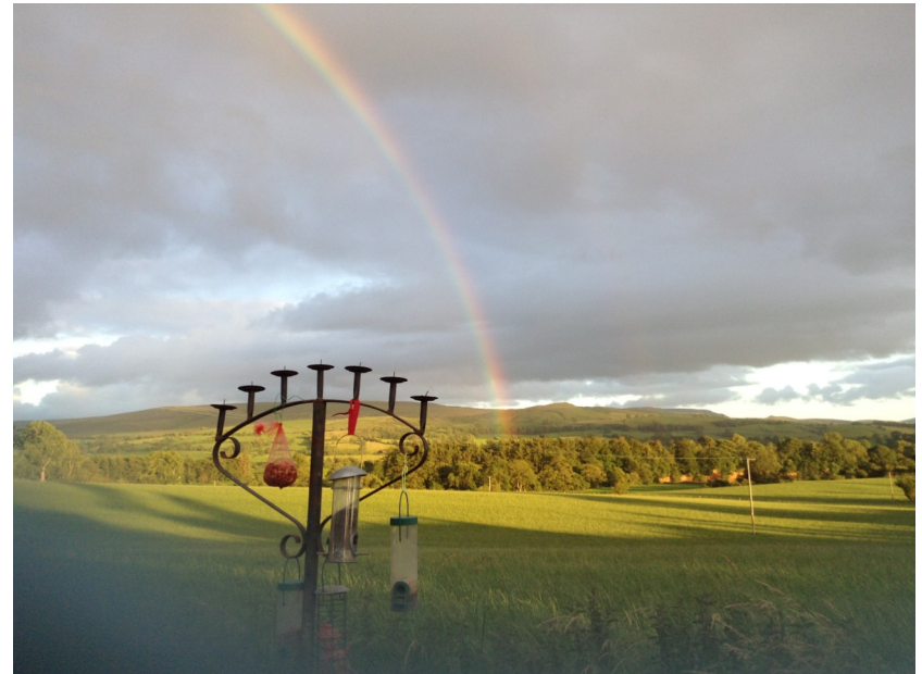
Photograph taken by Joyce Worsfold, Brough Sowerby