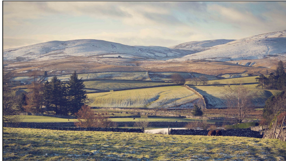
Looking towards the Howgills from Ravenstonedale

KIRKBY STEPHEN, APPLEBY & TEBAY METHODIST CIRCUIT