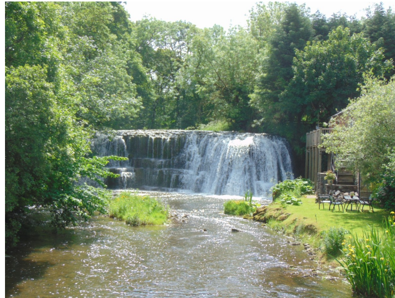
Photograph of Rutter Falls near Appleby

KIRKBY STEPHEN, APPLEBY & TEBAY METHODIST CIRCUIT